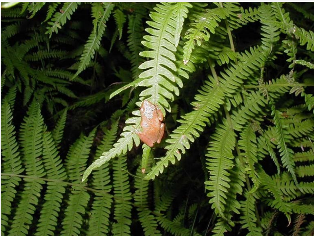
A spring peeper clings to a fern.

Birds Turkeys are present and may be hunted in season. Songbirds, woodpeckers and forest raptors may also be seen or heard.