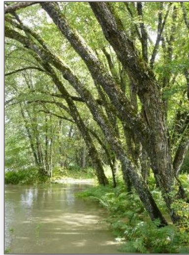
Floodplain forest swamp

swamp or sedge meadow, and shrub-scrub swamps, emergent marshes, and floodplain forests. Five outstanding