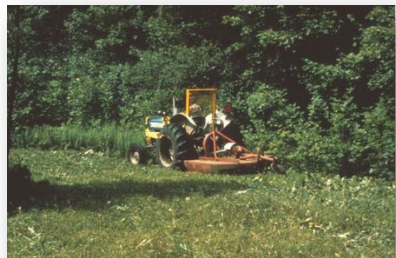
Brush hogging at Wild Branch WMA maintains field habitat used by many wildlife species.

Fish Native brook trout may be found in the Wild Branch.