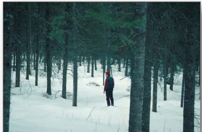
Spruce-fir shelterwood provides deer-wintering habitat in Victory Basin WMA.

Fish The section of the Moose River upstream of Rogers Brook provides the best habitat for brook trout.