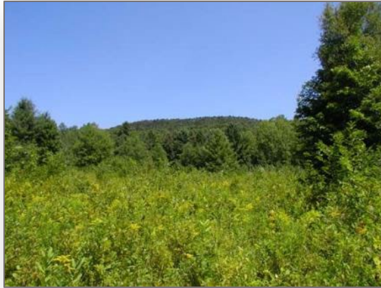
Looking upslope at Riley Bostwick WMA.

Fish Brook, rainbow and occasionally brown trout are found in Nason Brook. The brook also contains white suckers, creek chub, longnose and blacknose dace, and shiny sculpins.