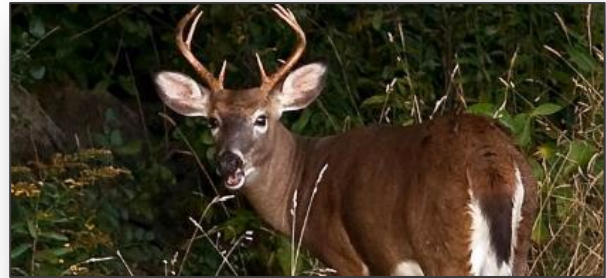
White-tailed deer

Mammals White-tailed deer, cottontail rabbit and