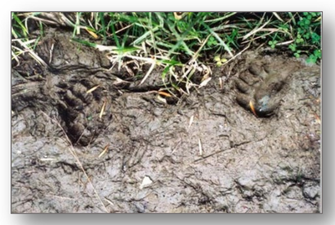
Bear tracks in mud and snow.

The WMA was acquired by the State of Vermont in 1990 as a result of Act 250 mitigation proceedings that compensated for deer wintering habitat lost from a development project. The Vermont Fish and Wildlife Department manages this WMA as a deer wintering area while providing public access for compatible consumptive and non-consumptive uses.