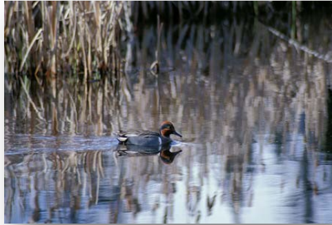
The shallow waters of Whitney and Hospital Creeks are attractive to migrating green-winged teal.

Fish Brown bullhead, yellow and white perch, black crappie, largemouth bass, longnose gar, northern pike, channel catfish and carp are all likely to be found in the waters of Whitney and Hospital Creeks and in Lake Champlain.