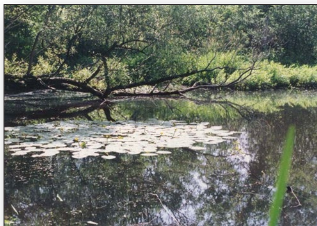
Water lilies float on the Lower Lamoille River oxbow.

This is a relatively new WMA, acquired with the assistance of The Nature Conservancy in 1995. Vermont Duck Stamp monies were used in part. The State also received a grant from the North American Wetland Conservation Act and a private donation.