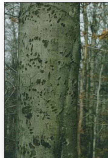
Bears climb beech trees to get to the beechnuts.

Shrub species include hobblebush, striped and mountain maples, red-berried elderberry and mountain ash. Over 50 kinds of herbaceous species – including blue cohosh, wild sarsaparilla, mountain aster, Canada-violet, sweet cicely, dogberry, red trillium wood-nettle, foam flower, twisted-stalk, wild lily-of-the-valley and wood-sorrel occur here. Some of the ferns on the WMA are spinulose wood-fern and rattlesnake, Christmas, Braun's holly and hay-scented ferns.