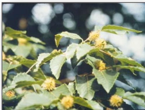
Beechnuts are a major food source for bear and other species.

The Phillips parcel was added in 2000, which connects Huntington Gap WMA with Lewis Creek WMA, forming a large contiguous tract of public land. Federal Pittman-Robertson funds, which are generated from a tax on firearms and ammunition, were used for this parcel.