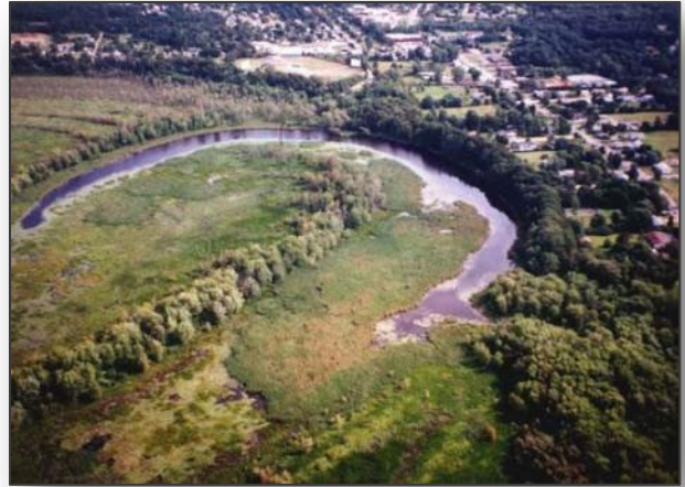
Halfmoon Cove is a slice of wildland near suburban Colchester.

trees. Common wetland plants include water lily, duckweed, cattail and wild rice. Some unusual plants found in the cove are cursed crowfoot, white adder's mouth and nodding trillium.