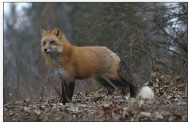
Red foxes are adaptable and utilize a variety of habitats.

Mammals Besides white-tailed deer, this forested tract offers shelter and food to many forest mammals. Game species include black bear, moose, fisher, bobcat, coyote, fox, cottontail rabbit, raccoon and gray squirrel. Non-game species one may find are skunk, opossum, porcupine, flying squirrel, chipmunk, vole species and shrew species.