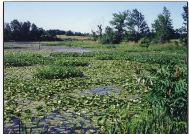
Wetland plants growing in East Creek provide habitat for invertebrates, which are a food source for birds.

Birds This rich wetland supports a large number of birds and a great variety of species. There is good birding for wetland species including rails, American and least bitterns, green and great blue herons, common moorhens, ospreys and northern harriers. Canada geese, black and wood ducks, mallards, blue and green-winged teal, and hooded mergansers inhabit the marsh. Marsh wrens, red-winged blackbirds, eastern kingbirds and Baltimore orioles are some of the many songbirds that can be found.