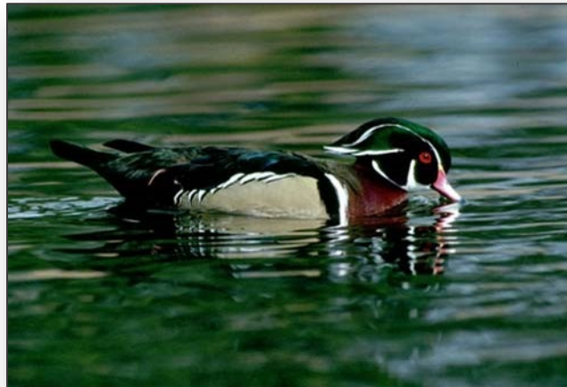
The wood duck population in Vermont has benefited from an extensive nesting box program.

Fish Otter Creek supports a warmwater fishery of large and smallmouth bass, chain pickerel, northern pike and brown bullhead.