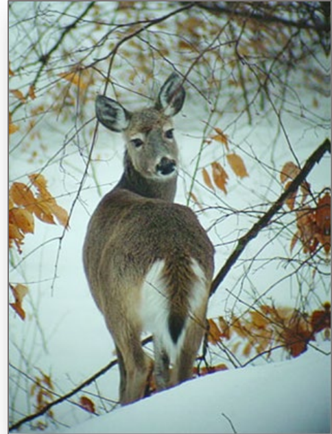
Deer need protected areas, usually coniferous woodlands, to survive Vermont's harsh winters.

Mammals Game animals include white-tailed deer, black bear, moose, snowshoe hare, fisher, raccoon and coyote. Expect to find many smaller non-game species as well.